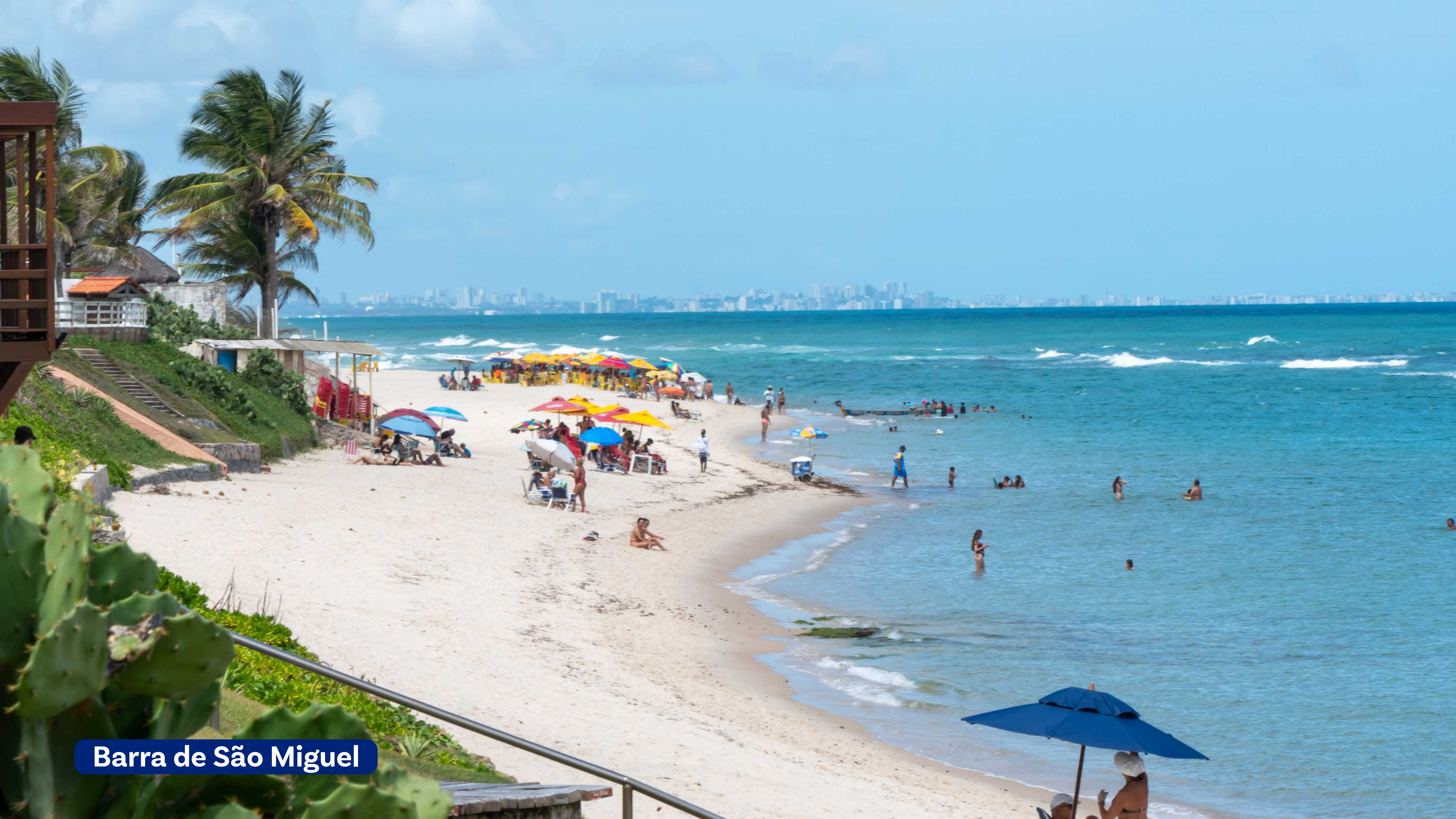
Barra de São Miguel