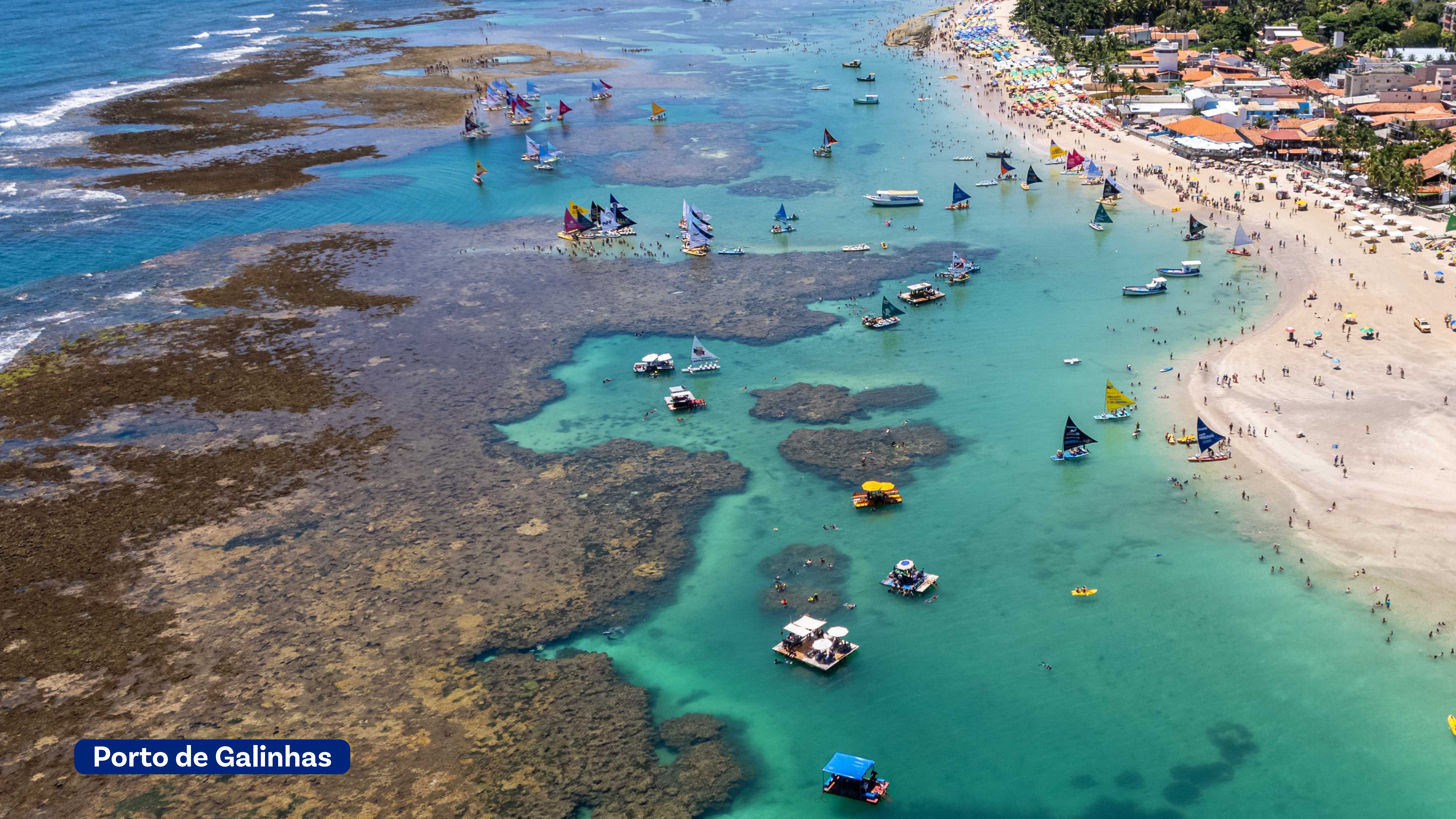
Porto de Galinhas